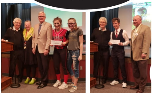
Chamber Event Banner