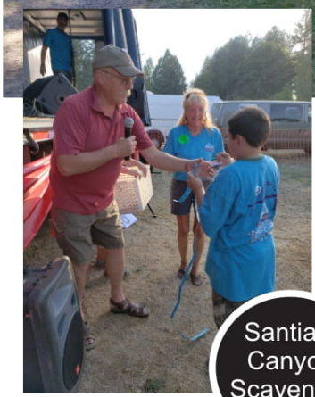
Santiam Canyon Scavenger Hunt