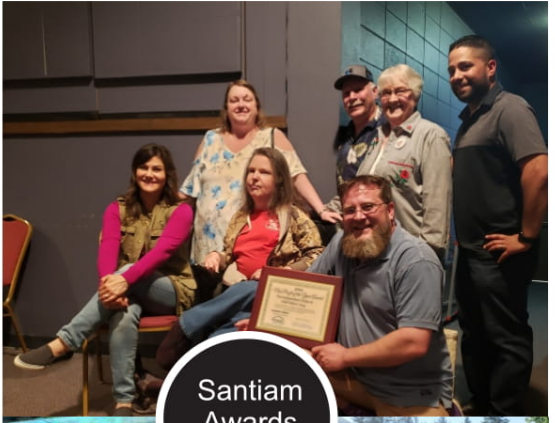
Santiam Awards Night