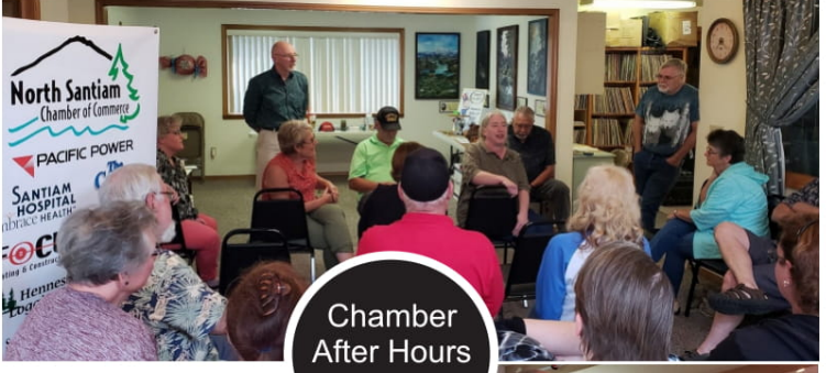
Chamber After Hours Networking