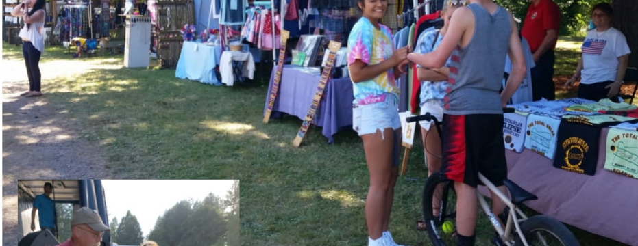
River City Music & Art Jamboree