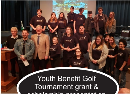
Youth Benefit Golf Tournament grant & scholarship presentation